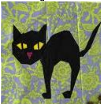
National Black Cat Appreciation Day August 17 th