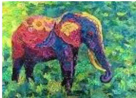
World Elephant Day August 12 th